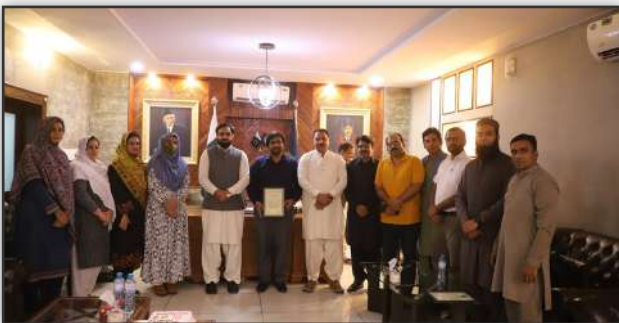
KFUEIT, Rahim Yar Khan