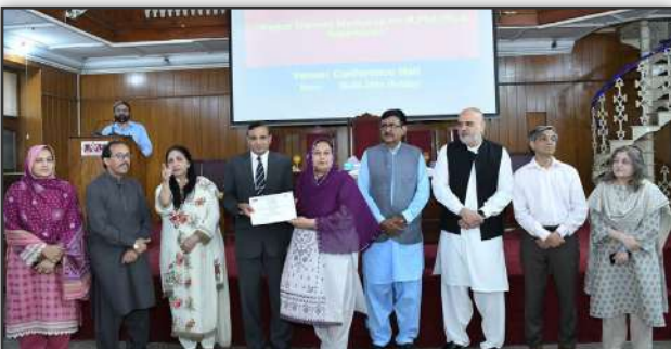
UVAS Ravi Campus, Pattoki